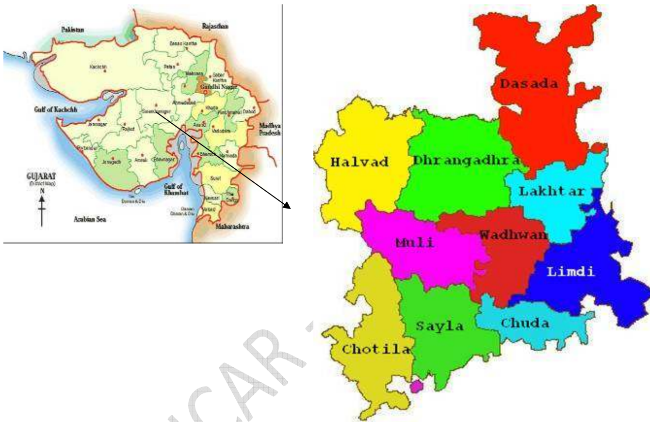
Fig.1: Location map of Surendranagar district