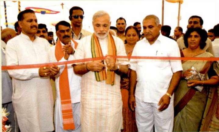
Hon'ble Chief Minister Shri Narendrabhai Modi inaugurating the mega krushi mela

The Mega Krushi Mela was organized during 24 to 26 th May, 2009 under the aegis of Krushi Mahotsav, 2009. The whole programme was composed of 3-day krushi mela, one national seminar on Fruit and Vegetable Processing and Export, nine seminars on different topics and four different exhibitions related to the agricultural technologies viz. (i) Fruit & Vegetable Processed Products Exhibition & Competition (ii) Exhibition of Gujarat Agro Industries Corporation Ltd. (iii) GGRC & (iv) Macro & Micro Irrigation systems. The Mega Krushi Mela was inaugurated by Hon'ble Chief Minister Shri Narendrabhai Modi in presence of Shri Dilipbhai Sanghani, Hon'ble Minister of Agriculture and Cooperation, Shri Vajubhai Vala,