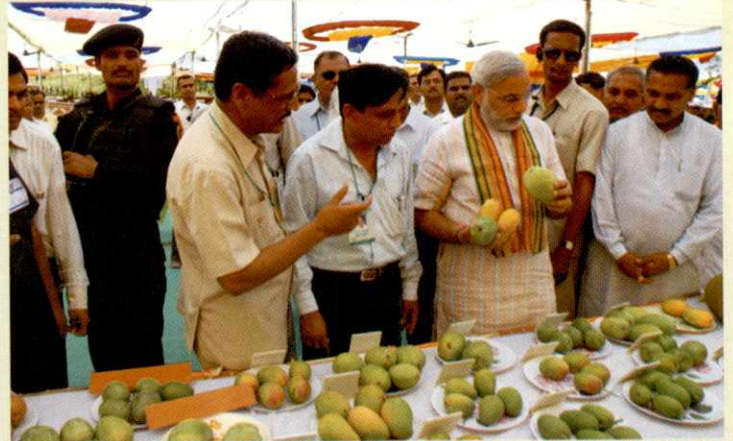
Hon'ble Chief Minister Shri Narendrabhai Modi observing the Mango Exhibition.

The Exhibition was organized jointly by Dept. of Horticulture, JAU, Dept. of Horticulture, Gujarat state,